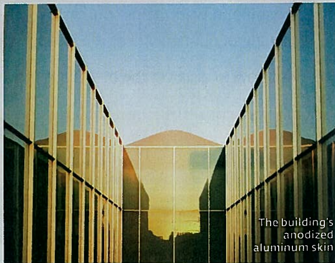
The building's anodized aluminum skin