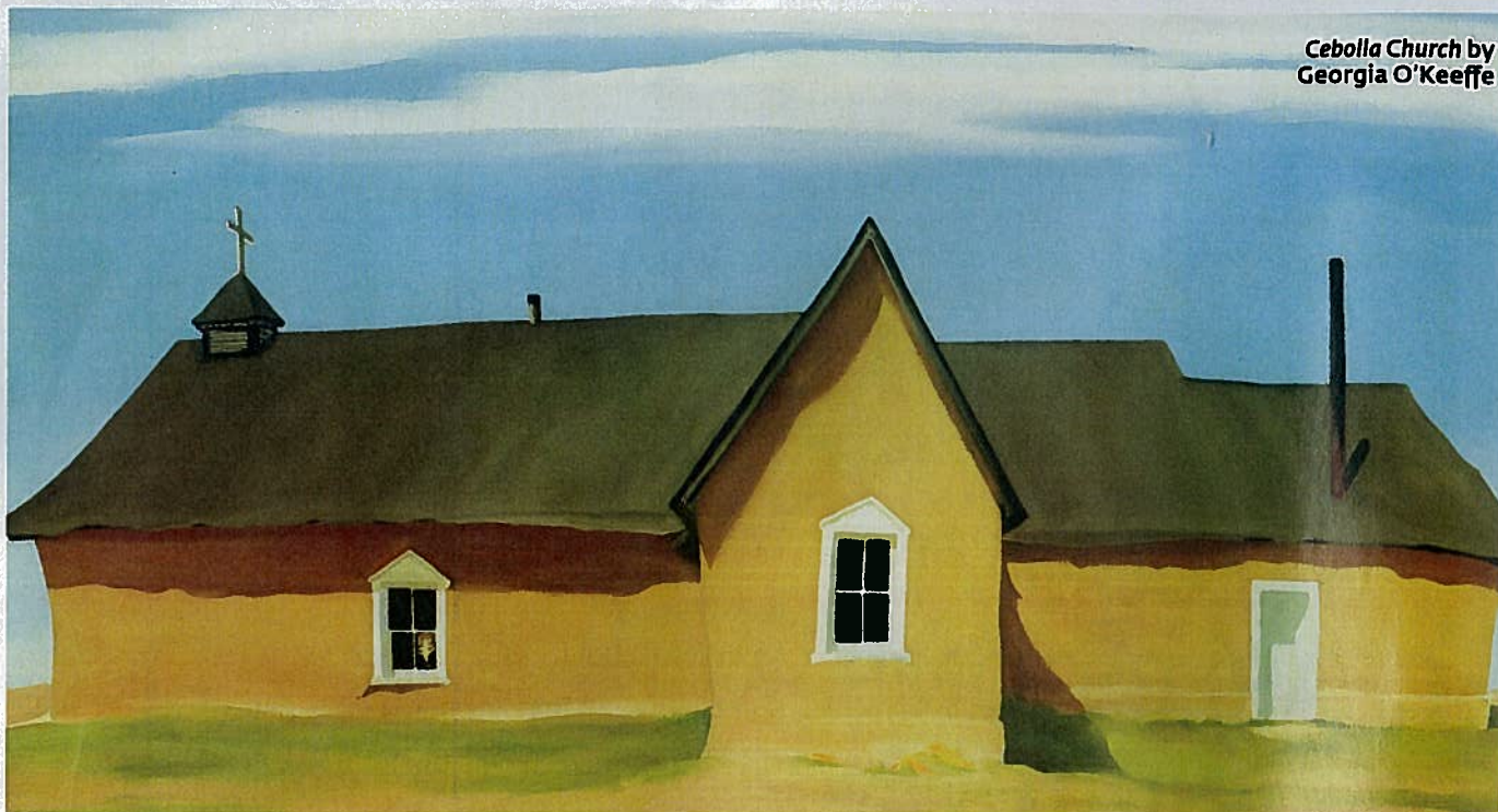
Cebolla Church by Georgia O'Keeffe