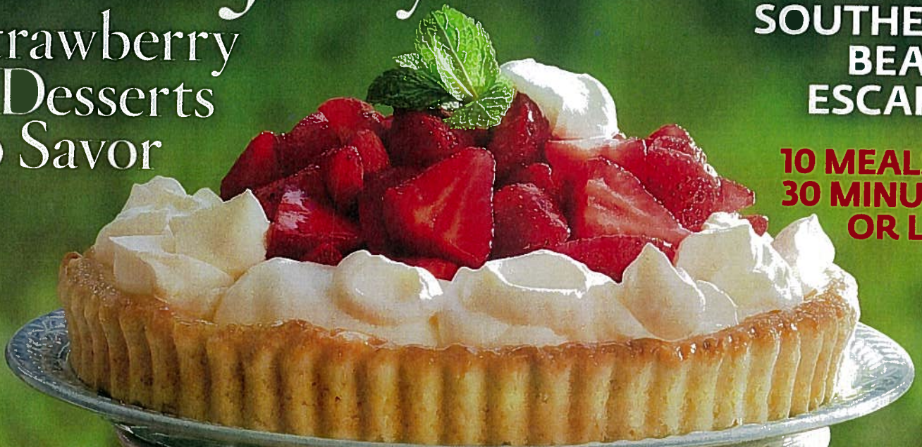
STRAWBERRY-ORANGE SHORTCAKE TART, PAGE 144