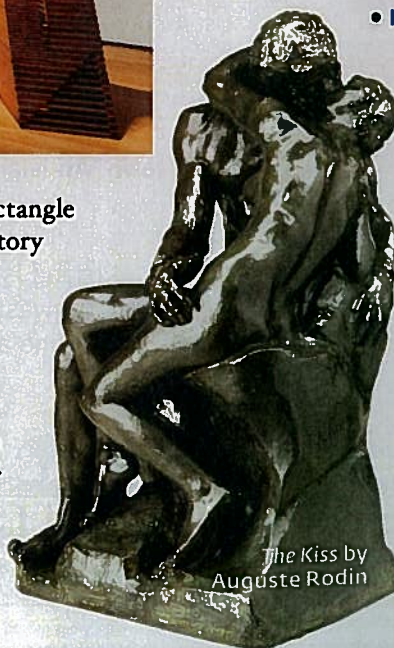
The Kiss by Auguste Rodin

• NEW ART. The expansion attracted more than 100 new art gifts, including pieces from modern masters Ellsworth Kelly and Robert Motherwell, as well as works by contemporary artists such as El Anatsui and Jaume Plensa. *