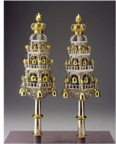
Pair of Torah Finials, ca. 1765.

When not in use, the Torah scroll is traditionally wrapped in a rich mantle with the protruding handles of its staves capped by decorative finials. The finials in the NCMA collection are architectural in form, perhaps reminiscent of a church tower such as the crowned steeple of Amsterdam's Oude Kerk . The finials' bells, which would chime as the Torah was carried in procession, may recall the bells adorning the robe of the high priest of the ancient Temple in Jerusalem.