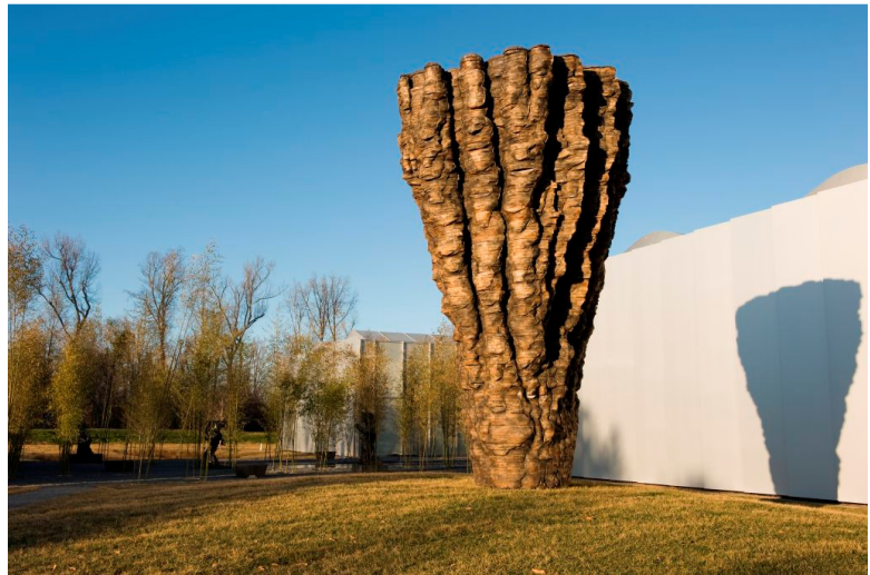
Ursula von Rydingsvard, Ogromna , 2009. Cedar and graphite, h. approx. 19 ft.; installed next to new NCMA building.

Established in 1947, the NCMA was the first major art-museum collection in the country to be formed by state legislation and funding—an extraordinary example of public support for the arts. Since that time, it has been immeasurably enriched by acquisitions that include many generous gifts, and today spans more than 5,000 years of history. Particular strengths include European painting, Egyptian funerary art, ancient Greek and Roman sculpture and vase painting, American art of the 18th through 20th centuries, the largest collection of Rodin sculptures in the American south, international contemporary art, and Jewish ceremonial objects.