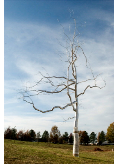
Roxy Paine, Askew , 2009.

As Paine has stated, "I've processed the idea of a tree and created a system for its form. I take this organic, majestic being and break it down into components and rules. The branches are translated into pipe and rod."