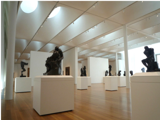
View of the Rodin galleries.